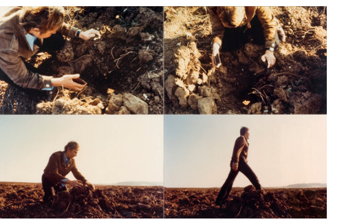
Enfoncement d'un rayon de soleil. 1969 4 color photographs. 110 x 163 cm (overall).

arable land, [she buried] a ray of sun in the earth with the help of mirrors' (Enfoncement d'un rayon de soleil).