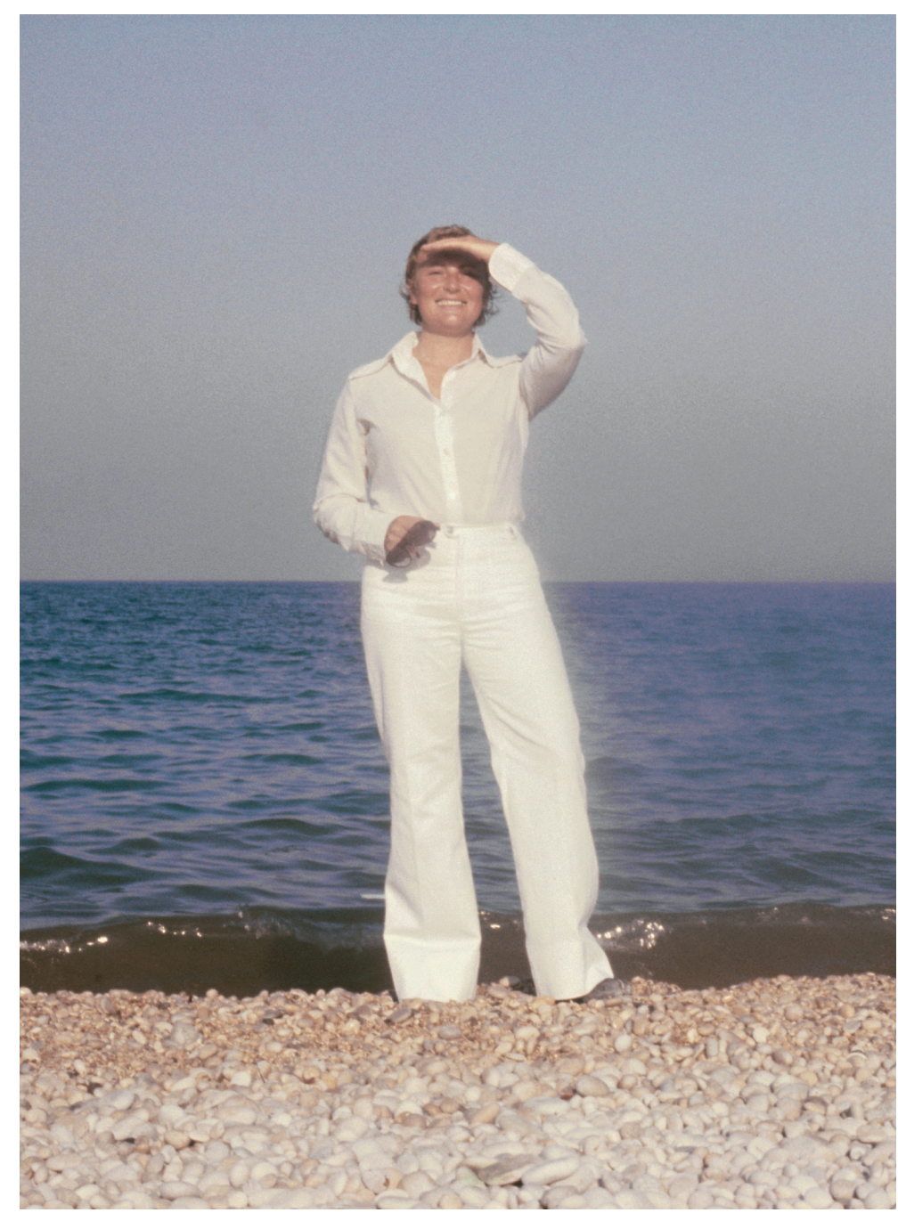
Gina Pane