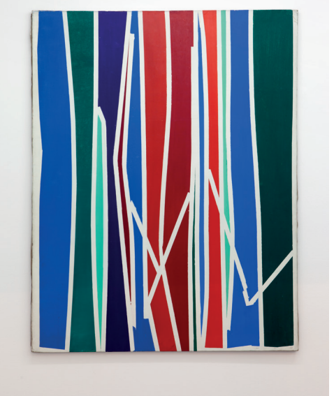
an intermediary, a passeur , a catalyst towards Oil on canvas. 146 x 113 cm. concrete realisation. The artist must moreover © photo. archives kamel mennour.

the end of the 1960s. In her determination, Before 1968, influenced by the vocabulary of Pane wanted to make her audience aware of suprematism, Gina Pane produced in her studio ecological questions: air pollution, lack of green an important series of drawings and paintings space, rising water levels and contamination, proposing simple and complex geometrical resource depletion, natural catastrophes, etc. forms: round, triangular, polygonal forms caught The photograph Situation idéale : terre – artiste up in the attempt to blend with the interior of - ciel [Ideal situation: earth-artist-sky] (1969) the surface of the paper or the canvas. Layered could in this sense be read as the programme and combined, they are painted in primary underlying her whole body of work: 'Between colours—the cool colours appearing to recede two horizontals: earth/sky, I placed my body and the warm colours to advance in respect vertically in order to provoke an ideal situation.' to the ground—with the aim of introducing Her feet planted firmly on the ground, staring a movement and a feeling of space (Room 1).