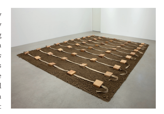
Installation: wood, hemp and earth. Approx. 7 x 400 x 420 cm. Exhibition view 'Gina

At the end of 1968, Gina Pane exhibited her triptych, Terre protégée. On a bed of arable earth in the Italian countryside, she set up 120 wooden structures tied together by hemp belts and orientated according to the points of the compass. Under each wooden block (which make one think of lifebelts), she placed a small packet of seeds in order to protect the richness of the earth—a theme that can also be seen in the installation Le Riz no. 1 (1970-1971), which is made up of a fragment of a rice paddy (rice, a universal food, acting for Pane as a link between the opposed ideologies of the capitalist and socialist countries).