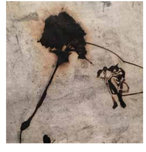
Arbres (recto-verso), circa 1840 India ink, black wash, pencil, charcoal and white gouache on paper 22 x 18 cm