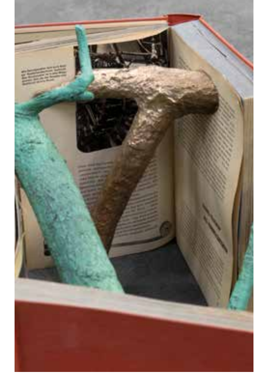
Intransmedium, 2016 Mixed media and bronze 71,7 x 186,7 x 57,8 cm