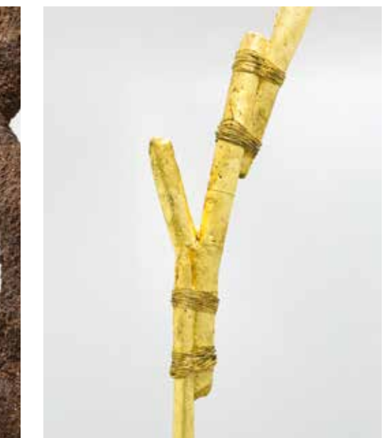
the sun at 12 am. 2019 Gilded bronze 306 cm ø

Hicham Berrada · Born in 1986 in Casablanca (Morocco). Lives and works in Paris and Roubaix (France).