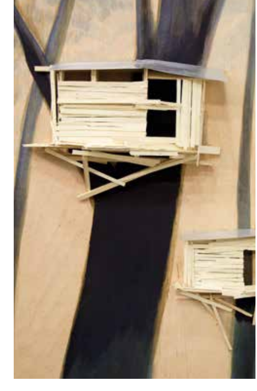
Tree Hut in Tremblay n°9, 2020 Wooden model, metal sheet and paint 153 x 210 x 10 cm